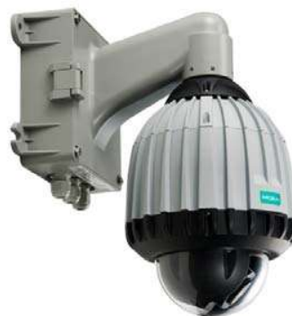
VPort 66-2MP PTZ speed dome camera with IP66 and IK10 ratings

To learn more about industrial-grade IP cameras, visit: