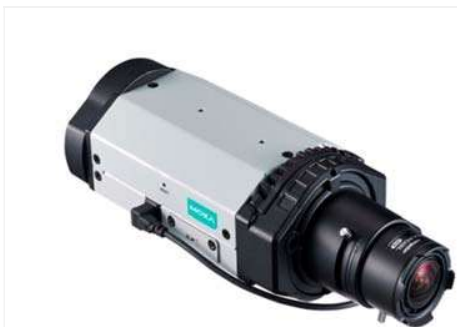
VPort 36-1MP, the world's IP camera with a -40 to 75°C wide temperature range

VPort 66-2MP in 2015. Setting a higher standard for robust engineering, the industrial-grade VPort 66-2MP will feature a vandal-proof design, along with IP66 rain and dust protection, and a NEMA 4X type form factor to assure absolute reliability in helping protect people, secure property and maintain safe, efficient processes.